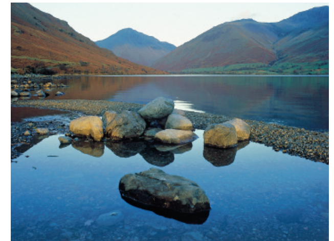
Great Gable and Wast Water.