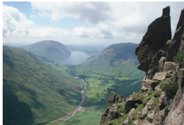
Above: Sphinx Rock overlooking Wasdale.